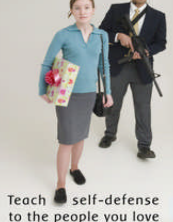
Can you afford a full-time bodyguard for every member of your family?

At Personal Protection, Inc., we provide the best personal, on-line, and distance training you can get. Whether you want to learn un-armed self defense strategies, or you want to learn how to safely own and use a firearm for self defense, we have a program to help you get where you want to be. We have both basic and advanced courses ready for your learning experience.